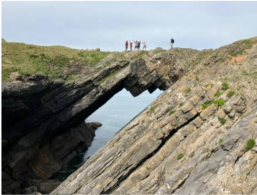
Devils Bridge at Worms Head